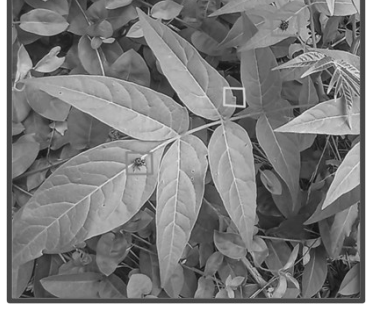
Figure 1: Close up showing characteristic notch and spotted lanternflies.

videos, at https:// extension.umd.edu/ resource/tree-heaven/.