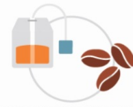
Coffee Grounds & Tea Bags no foil