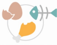
Meat, Fish, Egg Shells, Dairy