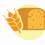
Bread, Pasta, Rice, Baked Goods