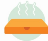
Paper Products napkins, plates, egg cartons, pizza boxes, toothpicks